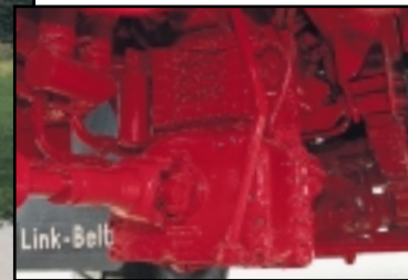
ZF automatic/powershift transmission