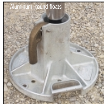
Aluminum, round floats