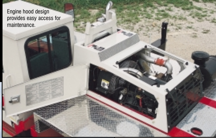
Engine hood design provides easy access for maintenance.