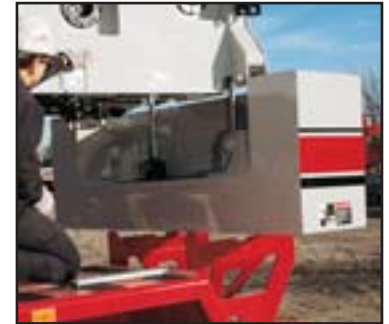
Fast & efficient hydraulic counterweight removal enhances roadability