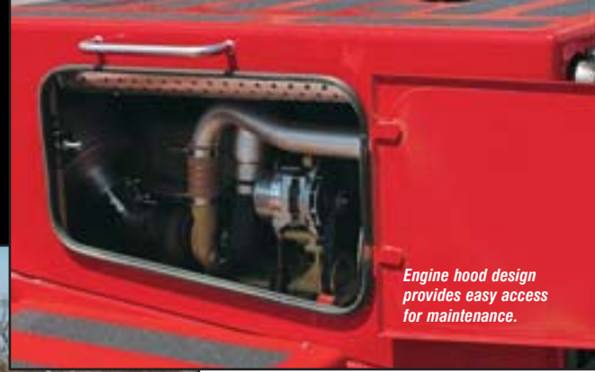
Engine hood design provides easy access for maintenance.