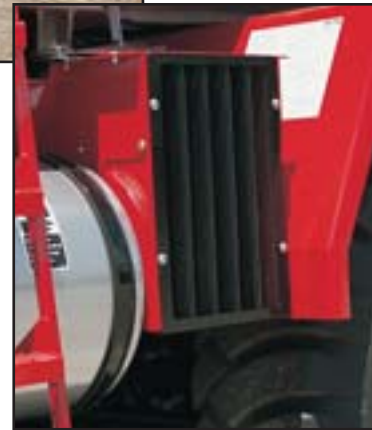
Transmission oil is cooled by a thermostatically-controlled oil cooler to provide maximum cooling under the most extreme job conditions.