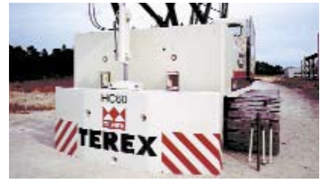
Hydraulic removable counterweight system