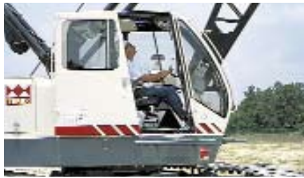
Environmental operator's cab